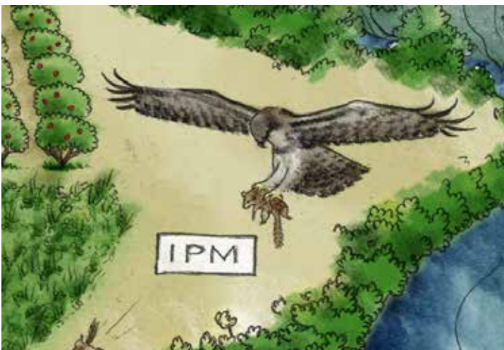
Beneficial natural processes, such as Integrated Pest Management (IPM), help to control rodents.

It is highly unlikely that farmers would ever intentionally sell contaminated produce. In the past, it was long held that common sense approaches were sufficient to ensure produce did not have food-borne pathogens. Animals were discouraged from production areas because they damaged crops. The potential for animal manures applied as fertilizers and soil amendments to result in water and crop contamination with human pathogens was well recognized. However, in 2006, everything changed when an outbreak of E. coli O157:H7 was traced back to a farm on California's Central coast, the center of the state's fresh-cut salad industry. While it was never unequivocally determined how the spinach became contaminated, non-native feral pigs, contaminated irrigation water, and adjacent cattle operations were all considered as possible sources. All wildlife and the habitat they occupied became scrutinized by public health, academia, and especially the leafy greens industry.