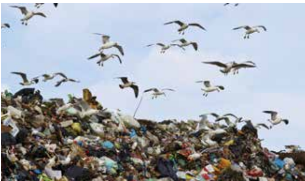
Wildlife living near areas with high levels of pathogens, such as these landfill-dwelling seagulls, may pose a greater risk of transferring pathogens than wildlife not associated with such areas.