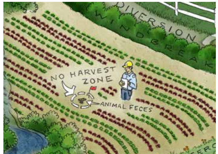
Periodically monitoring for animal damage or feces in the production field ensures a safe harvest.