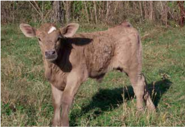
Young livestock are likely to carry higher levels of pathogens than adults.